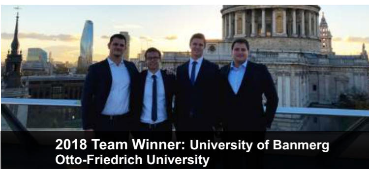
2018 Team Winner: University of Bamberg Otto-Friedrich University

Every year over 5000 candidates participate in the Global Investment Banking Valuation Olympiad