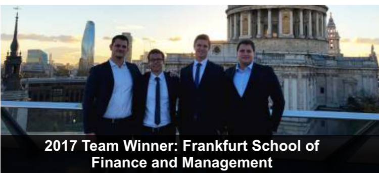
2017 Team Winner: Frankfurt School of Finance and Management

Every year over 5000 candidates participate in the Global Investment Banking Valuation Olympiad