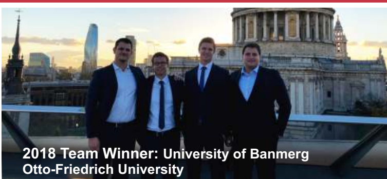
2018 Team Winner: University of Bamberg Otto-Friedrich University

Every year over 5000 candidates participate in the Global Investment Banking Valuation Olympiad