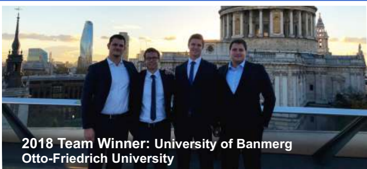
2018 Team Winner: University of Bamberg Otto-Friedrich University

Every year over 5000 candidates participate in the Global Investment Banking Valuation Olympiad